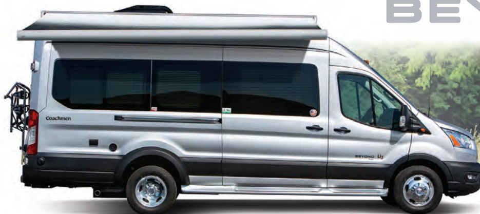
Optional bike rack shown